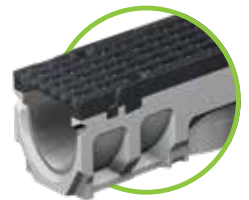
BG-FILCOTEN pro G